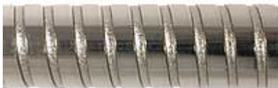
Bright Nickel plating