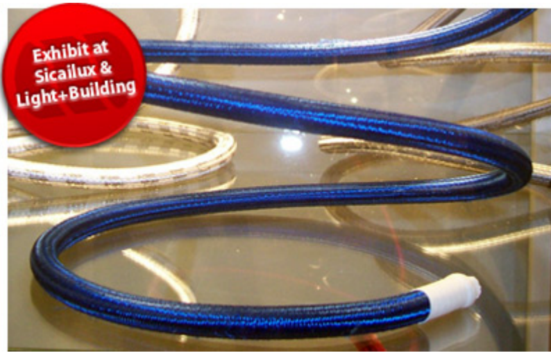
Covered by textile