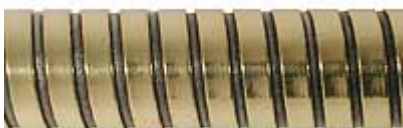
Polished and transparent lacquered Brass